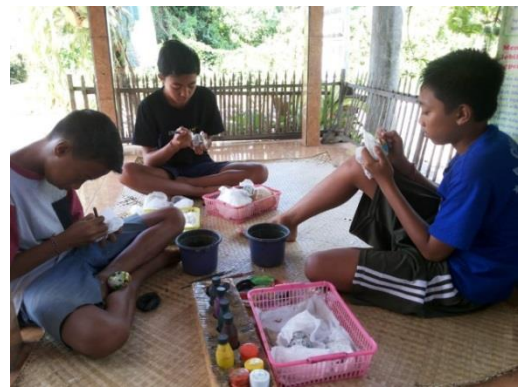
Figure 3. Wooden Egg Painting Activity