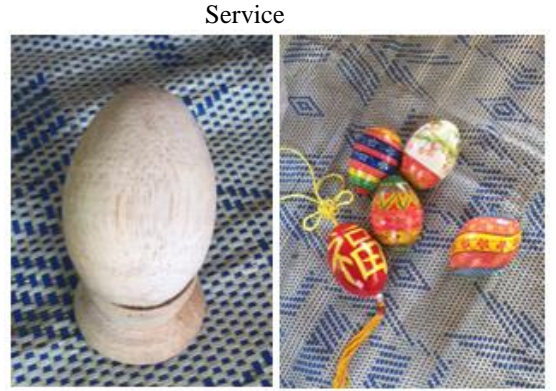
Figure 2. Raw Materials and Wood Painted Eggs Products