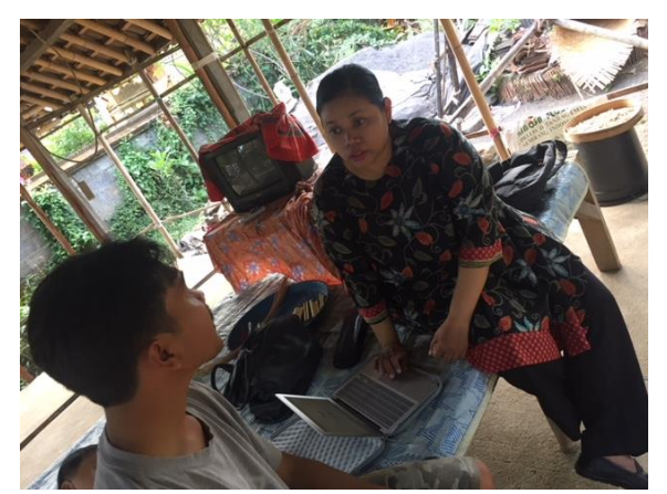
Figure 2. Introduction to the Community

During interview, researcher discovers that the conducted training were beneficial to craftsmen. This can be proved by their understanding and ability in using the Online Marketplace media, Tokopedia, to publish their Wood Painted Egg products.